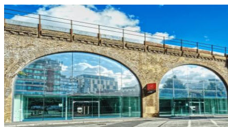
The Arch Company – U.K.