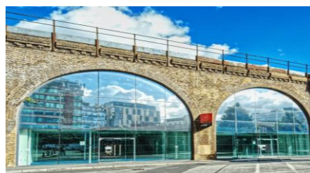
The Arch Company - U.K.