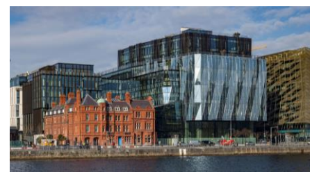
Adare Office Asset – Dublin, Ireland

Note: When used in this document and unless otherwise specified or unless the context otherwise requires, references to the "Fund" or "BEPIF" should be read as references to Blackstone European Property Income Fund SICAV ("BEPIF SICAV"), Blackstone European Property Income Fund (Master) FCP and their Parallel Entities. All portfolio metrics presented in this material relate to the Fund, except performance and fees and share class information, which relates to BEPIF SICAV. The inception date for BEPIF SICAV Class IA, Class ID, Class AA and Class AD shares is October 1, 2021. Different investor eligibility requirements and minimum subscription amounts may apply in certain jurisdictions. Please refer to page 3 for more information on BEPIF SICAV's performance. Please refer to page 5 for additional sourcing and disclosure information. Capitalized terms used but not defined have the meanings set forth in the prospectus prepared for BEPIF SICAV (the "Prospectus"). Please refer to the Prospectus for further information.