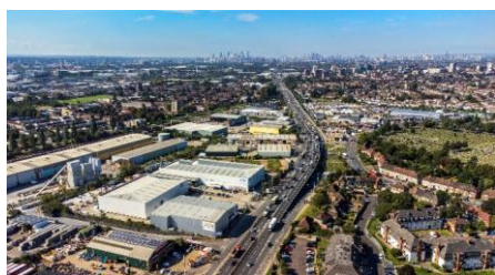
Mileway – Pan-European

Your capital is at risk and you may lose some or all of your investment. There can be no assurance that the Fund will achieve its objectives, pursue any particular theme or avoid substantial losses. Past performance does not predict future returns. The use of leverage or borrowings magnifies investment, market, and certain other risks and may have a significant impact on returns, resulting in the partial or total loss of capital invested. Dividends are at BEPIF SICAV's Board of Directors' discretion and are not guaranteed. The below investments are not representative of all investments of a given type or of investments generally.