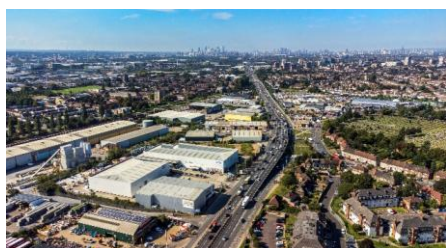
Mileway - Pan-European

Your capital is at risk and you may lose some or all of your investment. There can be no assurance that the Fund will achieve its objectives, pursue any particular theme or avoid substantial losses. Past performance does not predict future returns. The use of leverage or borrowings magnifies investment, market, and certain other risks and may have a significant impact on returns, resulting in the partial or total loss of capital invested. Dividends are at BEPIF SICAV's Board of Directors' discretion and are not guaranteed. The below investments are not representative of all investments of a given type or of investments generally.