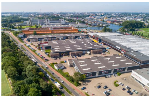
Mileway – Pan-European

17k portfolio company employees providing us proprietary insights in Europe