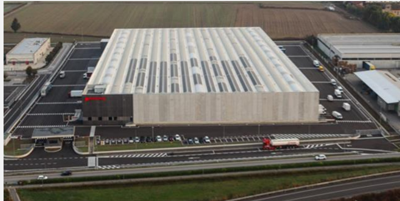
Luna Logistics Portfolio, Italy