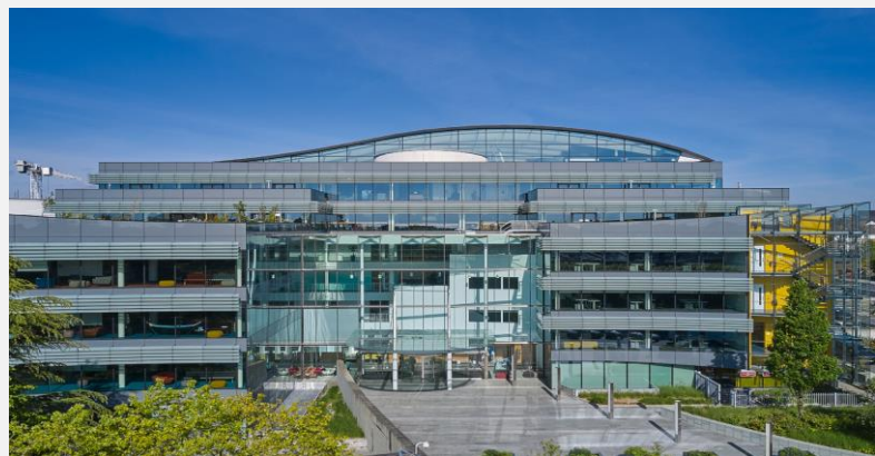
Infinity Office, Ireland

rent growth YoY for top-tier European office markets (4)